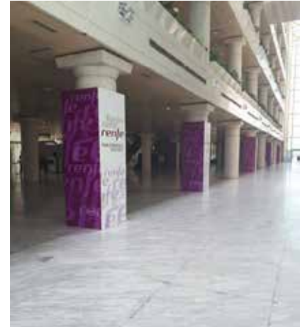
Columns Foam (Different locations)