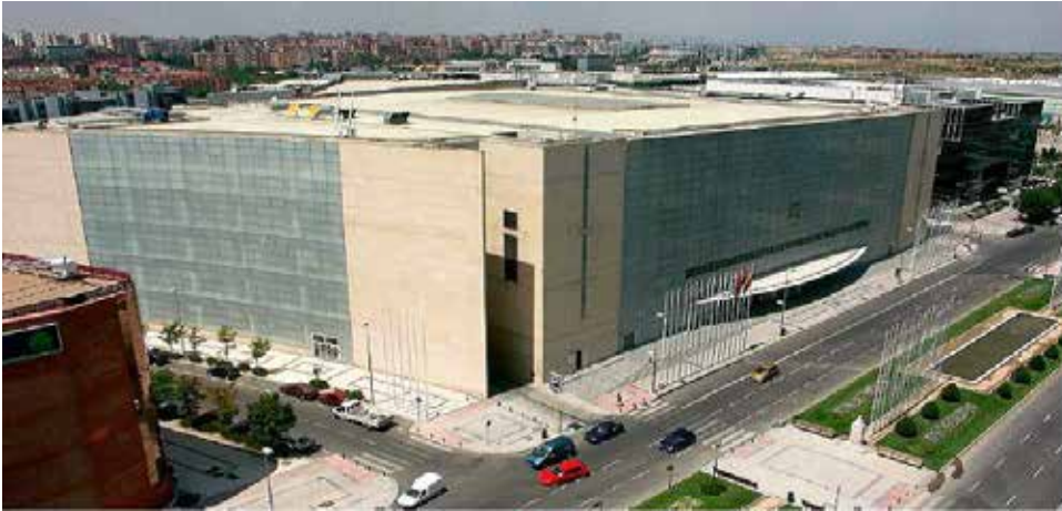
EuCAP2022 - THE VENUE: IFEMA PALACIO MUNICIPAL